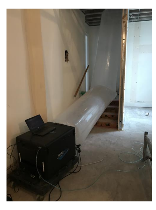
Aeroseal Injection Equipment

Objective: Reduce ductwork leakage in accordance with DW143 for Class B